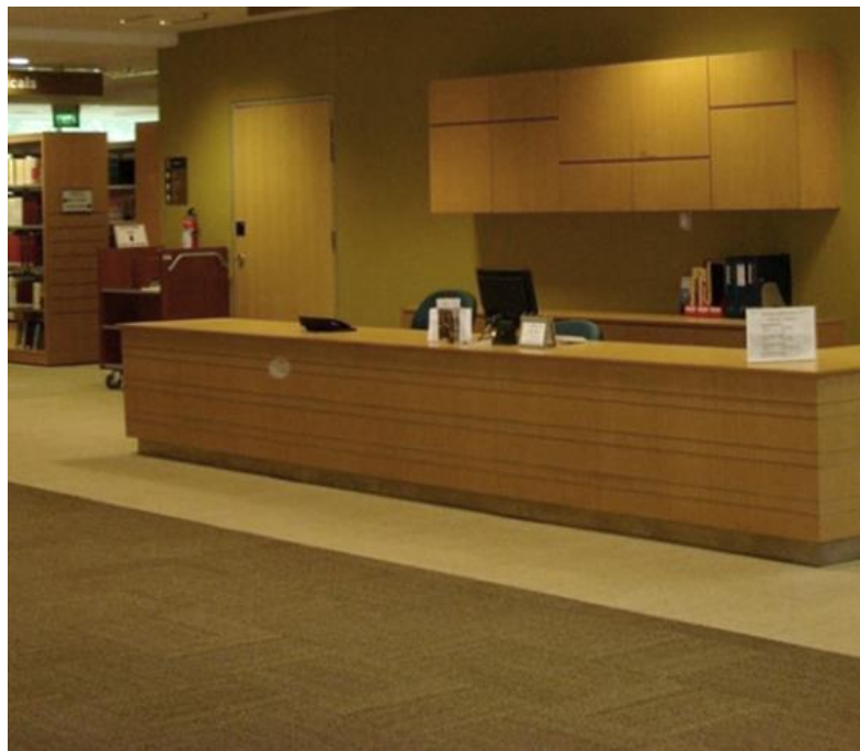
Information Desk (reference)